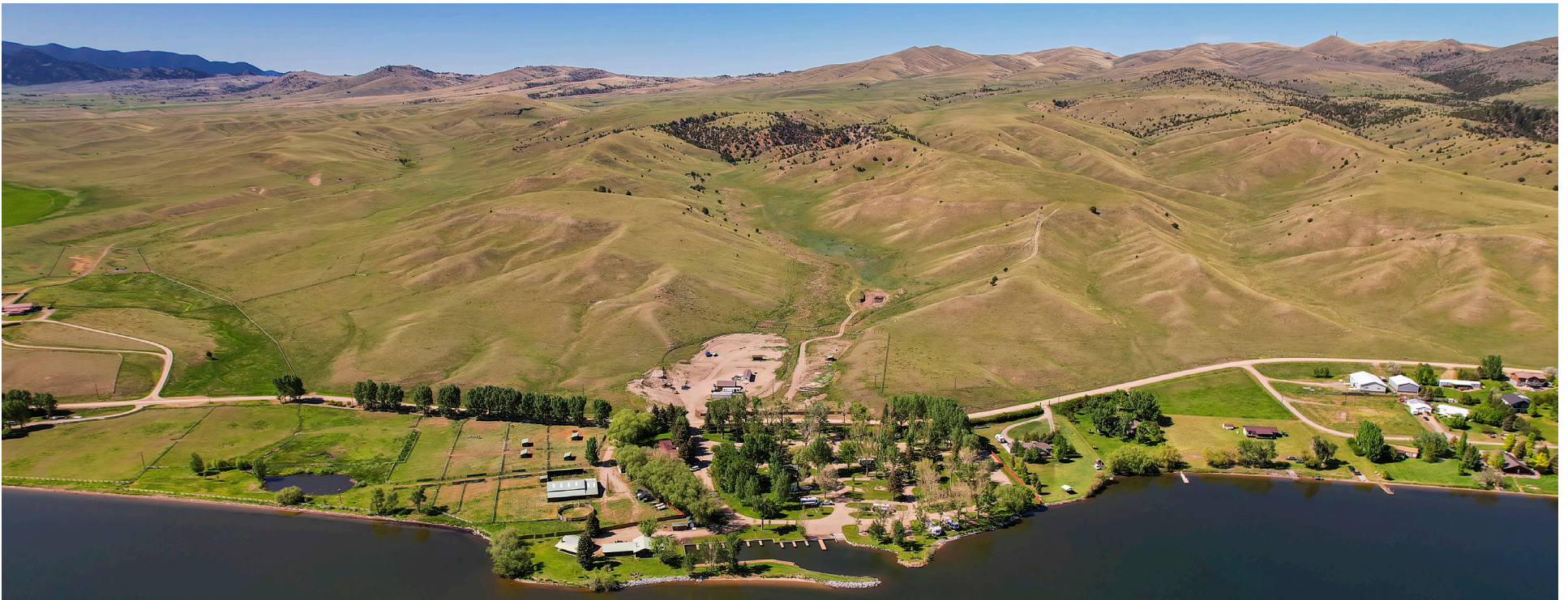
LOST HEART RANCH & LAKE SHORE LODGE